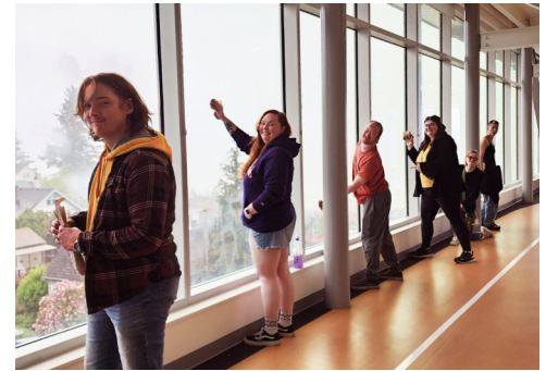
CCC Student Volunteers Cleaning windows in Patriot Hall

NW Natural provided a BBQ hot dog lunch. CCC Foundation members helped serve. A team of student volunteers helped with various clean-up projects on campus.