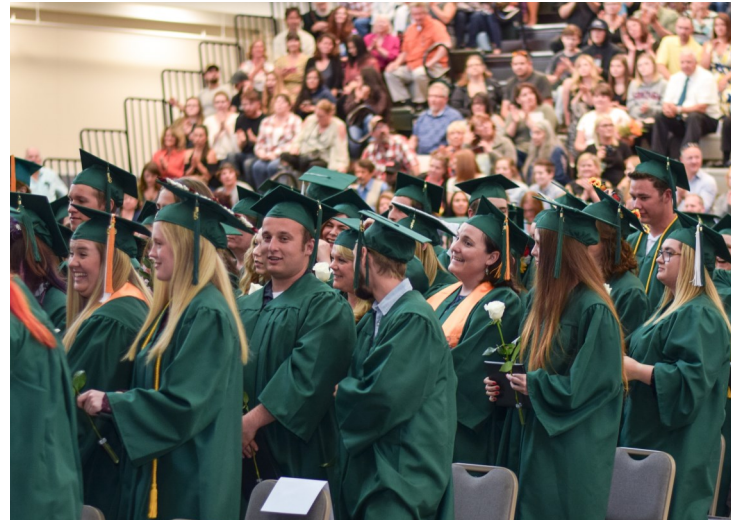
Congratulations to the 2024 ClatsopCC graduates.

Over $231,000 was awarded to students through scholarship funds. Thanks to the efforts of the Financial Aid Office nearly 78% of available scholarships were disbursed to students during the academic year. Over 150 students received funding.